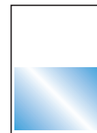
1/2 PAGE Horizontal 7" x 5" (W x H)