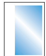
2/3 PAGE 4-5/8" x 10" (W x H)