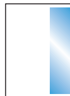
1/3 PAGE Vertical 2-1/4" x 10" (W x H)