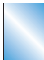
Full PAGE 8-3/8" x 11-1/8" (W x H) Trim size: 8-1/8" x 10-7/8" Please keep live area 1/4" from trim

Files accepted: 300 dpi, CMYK – flattened PDF, TIFF, EPS, or JPEG Upload files to: fwpi.com/upload-ad.php