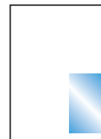
1/6 PAGE Vertical 2-1/4" x 4-3/4" (W x H)