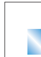
1/4 PAGE 3-1/4" x 4-3/4" (W x H)